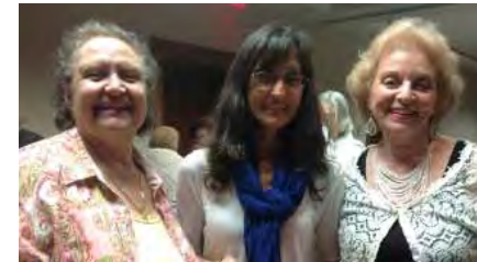
Achaia Chapter Members at September 2013 Meeting