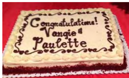
Celebration Cake for Achaia 54 September Meeting

After the break for the summer it was great to have the Sisters together again for our September where we celebrated the honors received at the District and National Conventions.