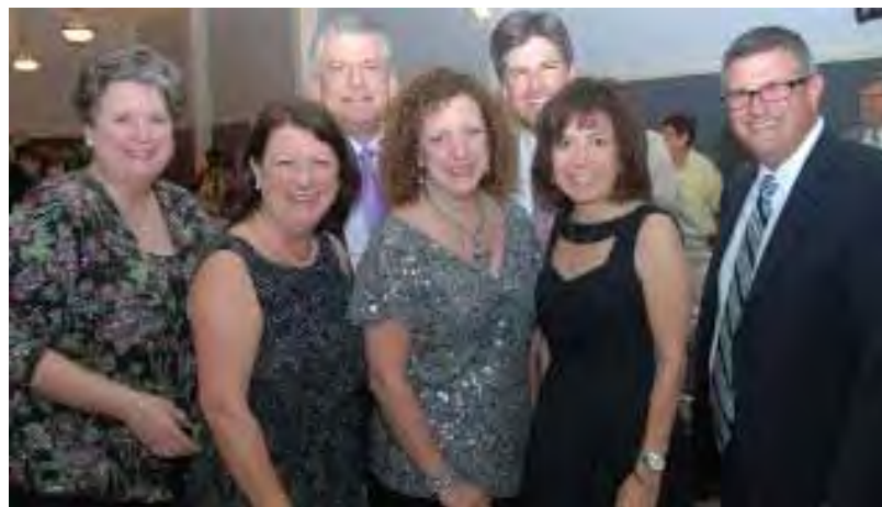
Third generation Booras AHEPA Family Members

The evening concluded with lots of dancing to the music of Ouzo Entertainment. It was a wonderful well deserved celebration.